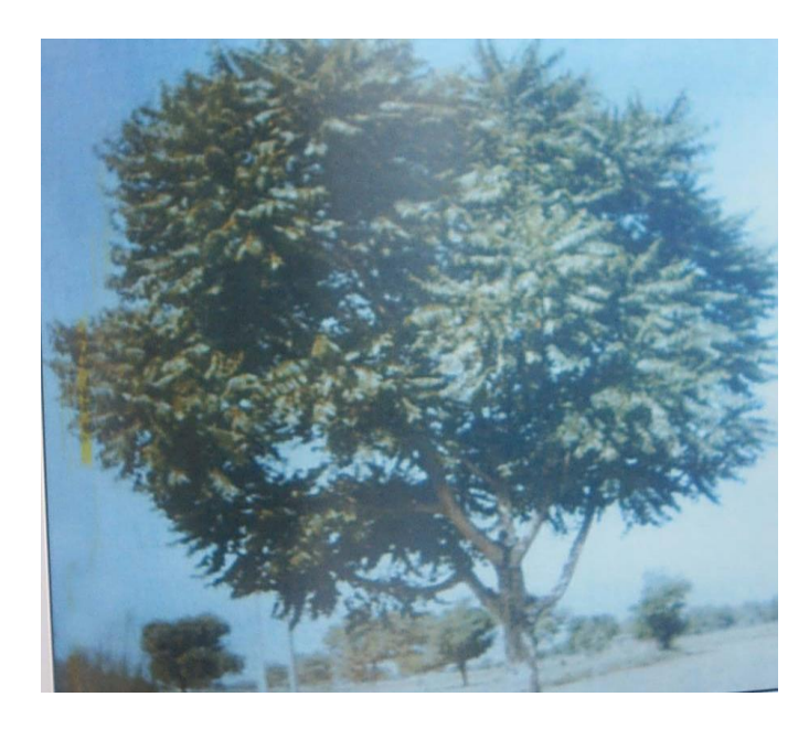
PLATE -1.1 Adhatoda vasica

The plant belongs to the family - Acanthaceae . From vegetational group point of view, the plant belongs to the group of "Tree", it is a medium sized tree, in nature some times it is also observed in the form of shrub. It is tall, much branched (branches are terete) and mostly evergreen tree. The leaves of the plant are lanceolate, large and dark green in colour. From leaf-class classification point of view the plant falls in 'Micro-phylls' class (i.e. 12 to 20 cm. long and 2.5 to 0.5 cm in width). The leaves have some characteristic odour and bitter in taste. Leaves margins are crenate and apex is acuminate with glabrous surface and smooth texture. From life-forms point of view, the plant falls in the group of "micro-phanerophytes". It's flowers are dense and white in colour with purplish markings. It's fruit's are capsular.